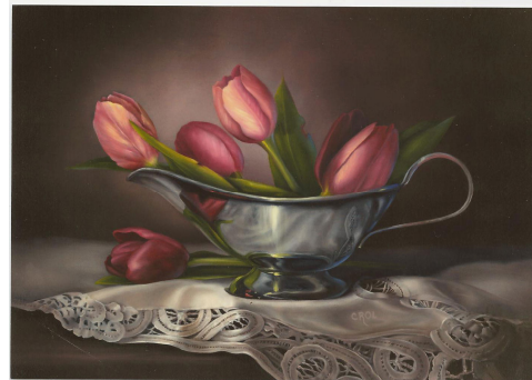
“Tulips, Silver & Battenberg”