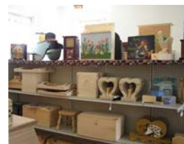
We carry a large variety of top quality wood surfaces. Check our website for updates and new products including our new metal art.